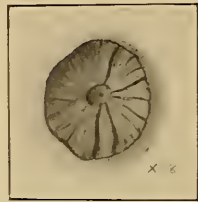
FIG. 5. Dryopteris Lloydii , indusium, \times 18 .

by the sporangia are similar in character in the two species, though not quite so numerous in the Greenland form.